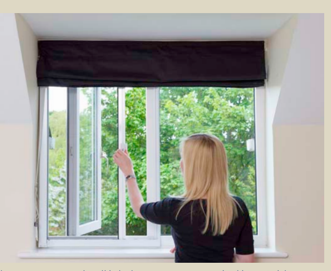
Pull across screens work well in bedrooms to stop you getting bitten at night