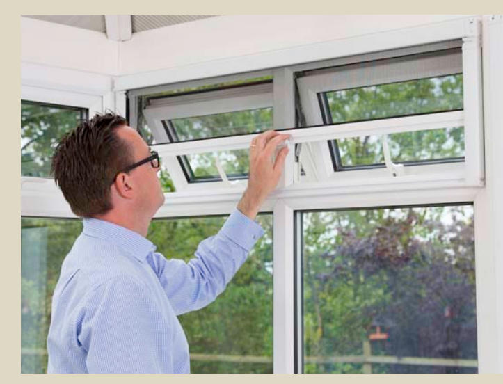
Pull down screens can be used to cover more than one window simultaneously