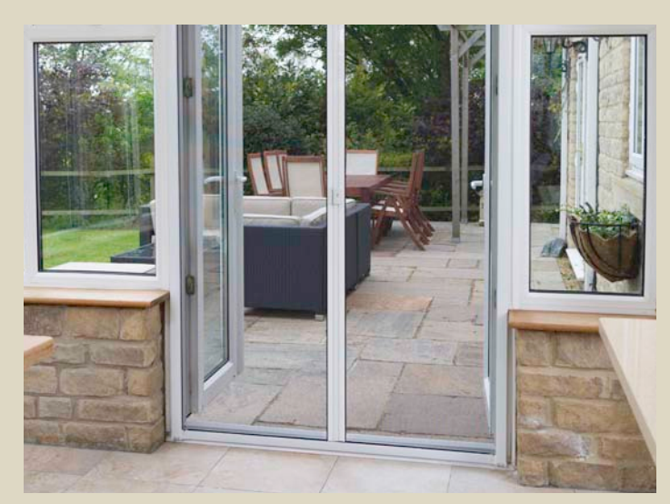
Double door screens are ideal for conservatories keeping them cool and insect free