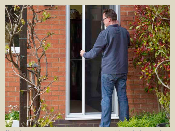
Single door screens allow you to access outdoor areas while keeping insects at bay